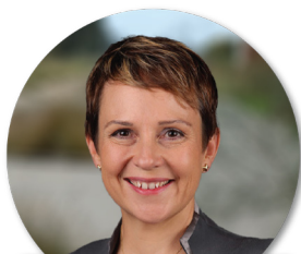
Jaala Pulford MP Minister for Small Business